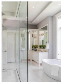
THE RESIDENCE'S DESIGN COMBINES A CALM, COOL COLOR PALETTE WITH A CLEAN, AIRY LOOK CREATED BY LOTS OF WINDOWS AND NATURAL LIGHT.