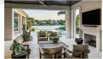
THE OUTDOOR WATERFRONT LIVING SPACE BOASTS SEATING AREAS ADJACENT TO THE POOL AND THE FIREPIT, A GRASSY AREA FOR LAWN GAMES, PLUS ACCESS TO THE BOAT DOCK.

"We added transom windows inside the upper portion of the kitchen wall cabinets and above some of the interior doors so light comes through," adds Grup, noting there is a bright, jaunty appeal throughout the home.