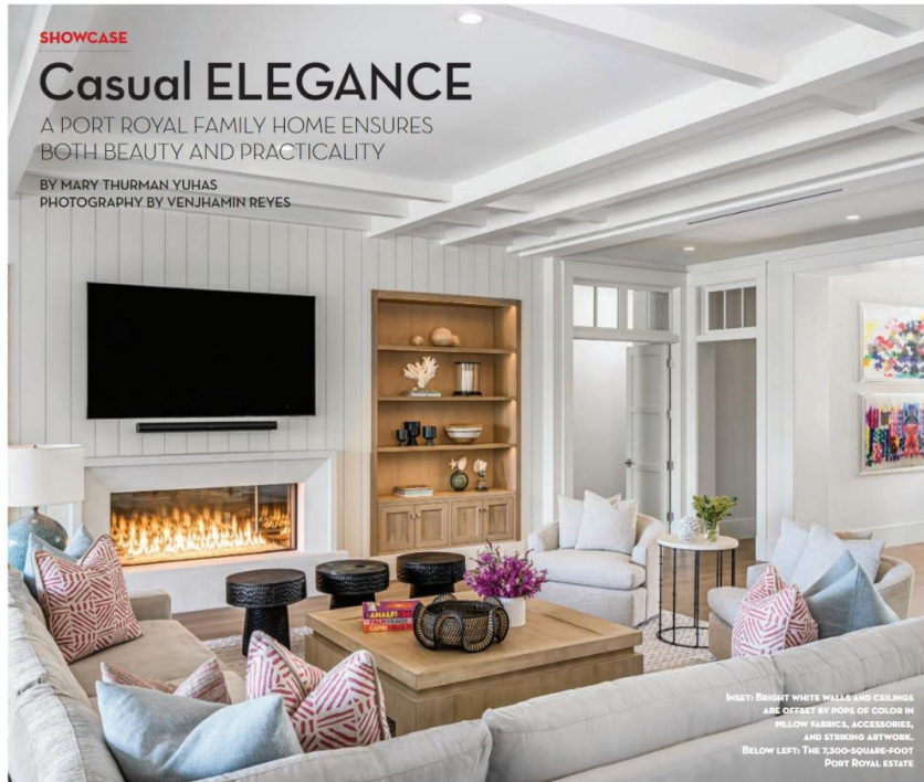
INSET: BRIGHT WHITE WALLS AND CEILINGS ARE OFFSET BY POPS OF COLOR IN PILLOW FABRICS, ACCESSORIES, AND STRIKING LIGHTING. BELOW LEFT: THE 7,300-SQUARE-FOOT PORT ROYAL ESTATE

BY MARY THURMAN YUHAS