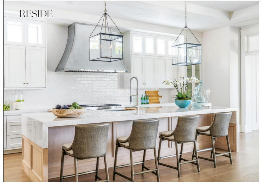
CLOCKWISE FROM TOP: THE KITCHEN SHOWCASES AN OVERSIZE CRISTALLO QUARTZITE WATERFALL ISLAND; THE INTERIOR STAIRCASE; THE INFORMAL DINING AREA FEATURES THOUGHTFULLY SELECTED ORGANIC ELEMENTS.